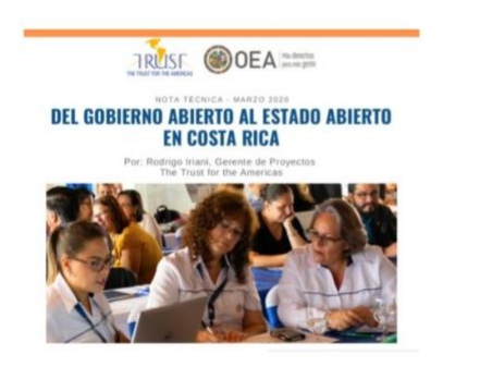
From an Open Government to an Open State in Costa Rica