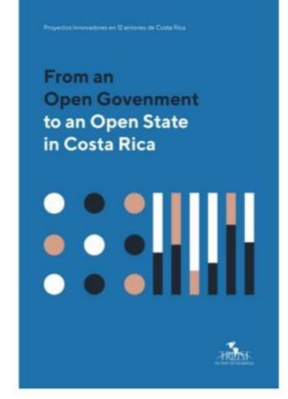
From an Open Government to an Open State in Costa Rica