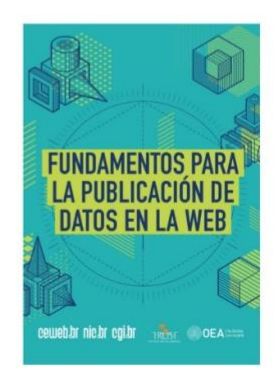
Fundamentals for Publishing Data on the Web