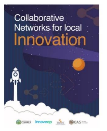
Collaborative Networks for Local Innovation

The Trust has created a solid knowledge base of content about the impact and benefits of open government in the region. We have created an open library available to any government and civil society organization in the region. You can access our online library here.