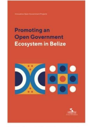
Promoting an Open Government Ecosystem in Belize